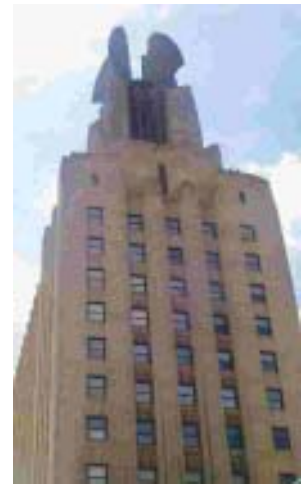
Times Square Building

1. The tour starts at the corner of Exchange Boulevard and Broad Street. Here is the winged Times Square Building (45 Exchange Boulevard), a dramatic example of Art Deco architecture and a monument to progress. It has been a major city landmark since the Genesee Valley Trust Company completed its construction in 1930. The cornerstone of the building, ironically, was laid on October 29, 1929, the day the stock market crashed. Fortunately, the bank survived the Great Depression.