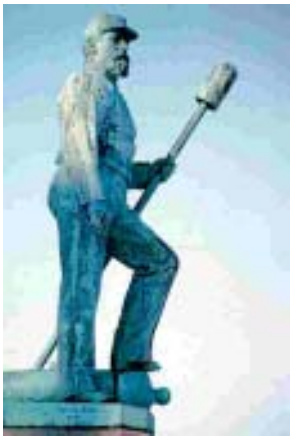
Washington Square Park

Continue on Court Street to Clinton Avenue. You'll have an excellent view of the First Universalist Church, 150 South Clinton Avenue.