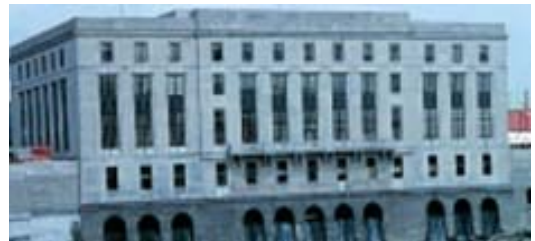
Rundel Memorial Building