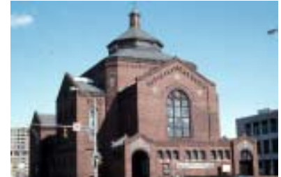
First Universalist Church

11. Constructed in 1908, the First Universalist Church , at the northeast corner of Washington Square, is the most important remaining work of prominent local architect Claude Bragdon. Its central plan, stained-glass windows, ceramic tile and terra cotta details recall Lombard-style churches of northern Italy. The interior, enhanced by furniture and lighting fixtures designed by Bragdon, is noteworthy for its use of structural steel as a design element.