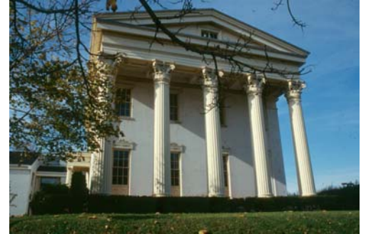
Jonathan Child House

In the early 20 th century, this former residence was used as a clubhouse and later as a church. In 1957, the Landmark Society purchased the property to save it from demolition. It became a primary example of adapting a historic residence to serve a contemporary business use. The rear addition was added in 1972.