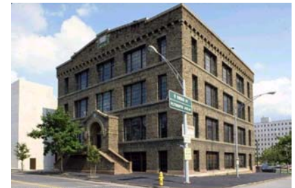
Bevier Memorial Building

To visit the Corn Hill Historic District now, walk across the pedestrian bridge on your left.