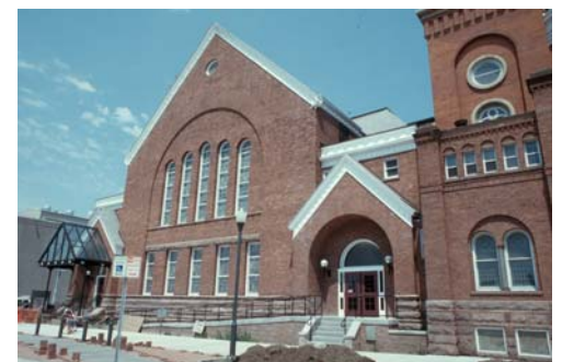
Hochstein Memorial Music School

In 1973, when three Presbyterian churches merged, this building became the property of the Downtown United Presbyterian Church. In 1978, the Hochstein Memorial Music School, a long-established Rochester music institution, acquired the building. Since 1920, the Hochstein School has provided high-quality music education to adults and children regardless of family income.