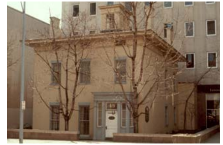
Ebenezer Watts House

Turn right onto Broad Street and walk until you come to the Plymouth Avenue intersection. Then turn left (south) on Plymouth Avenue and continue walking on the east side of the street until you come to a crosswalk