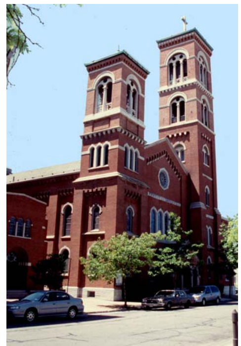
Downtown United Presbyterian Church

Walk south on Fitzhugh Street toward E. Main Street.