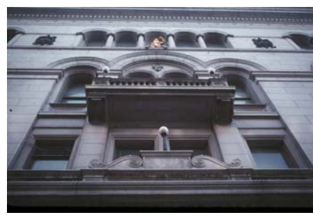
Monroe County Office Building

The Monroe County Office Building (4) is the former Monroe County Court House, built in 1894-96. It is the third courthouse on this site. Designed by J. Foster Warner, it replaced a smaller courthouse erected in 1850-51. The present building, representing the Neo-Classical revival of the 1890s, is a handsome example of the Italian Renaissance style, with its granite exterior featuring round-arched windows and heavy hood moldings. Look up at the wood statue of "Justice" in the front niche of the building, which was originally carved for and located atop the dome of the second county courthouse. Walk inside and see the sky lit central courtyard, a model of historic civic grandeur. It is open to the public weekdays from 9-5. Before you leave, look for the cornerstone with the three construction dates.