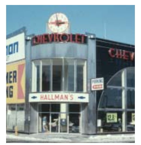
Hallman's Chevrolet, 1980.

converted into a restaurant, loft apartments and even a bakery.