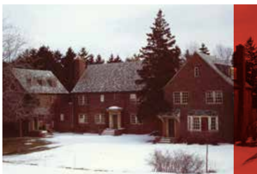
Former Nurses' Residence, Rochester Psychiatric Center 1700-block South Ave., Rochester, NY

Rochester’s first facility for the care of the mentally ill was established in 1857, when the “Monroe County Insane Asylum” was built on South Avenue. In 1891, the asylum was purchased by New York State and re-named the “Rochester State Hospital.” During the early 20th century, many new buildings were added, including a School of Nursing, which operated until 1973. Among them was a complex of three, 2-1/2-story, brick residences. Featuring slate roofs, picturesque details, and handsome Arts and Crafts design, they were a distinctive example of 1920s architecture. With changing programs and priorities, a number of historic campus buildings have been demolished over the past 30 years. These buildings were demolished during the past year. The surrounding site has been cleared and extensively re-graded for the new Golisano Autism Center, which is currently under construction and will be part of the Al Sigl Community of Agencies.