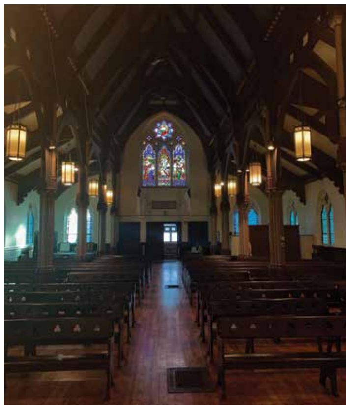
Calvary St. Andrew's Church, exterior and interior views.