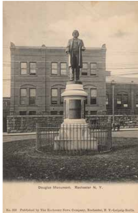
Postcard showing Frederick Douglass Statue in its original location at the corner of St. Paul Street and Central Avenue.

In what ways have tangible and intangible heritage become increasingly relevant in the age of #TakeItDown—an era defined by the reconsideration of the built environment and proclamation of removal, spurred by the campaign to remove the Confederate flag from its long-time placement on the South Carolina state capital? This piecemeal hashtag campaign has expanded to include, as well as foster, the removal of statues and emblems from public spaces. Broad-based awareness and local-turned-national interest and activity have prompted questions, most notably, asking communities to consider how sculptures,