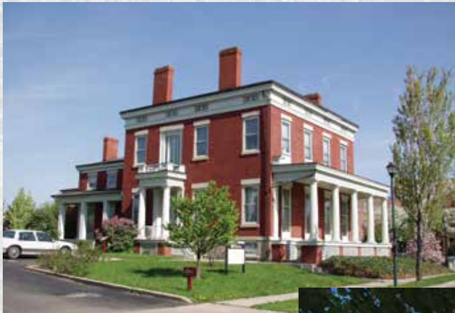
Farewell, Hoyt-Potter House 133 South Fitzhugh Street

Go to www.landmarksociety.org for details on when you can come and visit.