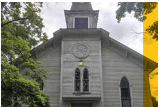
Logan Community Center (former First Presbyterian Church of Hector) 4074 County Road # 2, Town of Hector, Schuyler County

Located in the rural hamlet of Logan, on the east side of Seneca Lake, the Logan Community Center was originally built in 1832 for the congregation of First Presbyterian Church. Its Federal style meeting house design was enhanced with Victorian-era Gothic Revival details in 1878, including pointed-arch windows and a tower with belfry. Due to declining membership, the church closed in 1970. In 1986, the Logan Community Center Association was established to save the building. Its architectural and historical significance were officially recognized in 2001, with a listing in the State and National Registers of Historic Places. In 2009, the Logan Community Center Preservation Committee was formed to develop a community center. The LCCP Committee is now reaching out for technical assistance to evaluate the building, prioritize needs, identify funds for repairs, and secure community support for the continued care and use of this important landmark building.