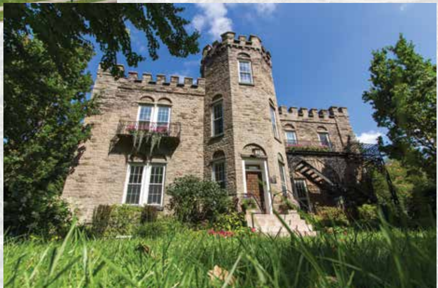
Hello, Warner Castle 5 Castle Park

Go to www.landmarksociety.org for details on when you can come and visit.