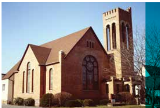
Former Lakeside Presbyterian Church 75 Stutson St, Rochester, NY

Erected in 1903, this Gothic Revival church is one of the most important public buildings in Charlotte. It was originally built as “First Presbyterian Church,” a congregation established in 1855, when Charlotte was a bustling village. In recent decades, social, cultural, and worship practices have changed dramatically, with many historic churches closing due to declining membership. In 2017, the congregation sold their church to the Bruce Music and Theatre Academy. The former church sanctuary and classrooms now provide excellent facilities for the Academy’s music and performance activities. Many churches today face a similar challenge. For congregations seeking help, check out Partners for Sacred Places: www.sacredplaces.org . Visit Sacred Sites Grant Fund for building repairs at www.nylandmarks.org .